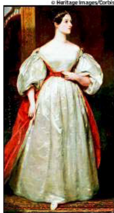
ROLE MODEL: Ada Lovelace, the daughter of Lord Byron, wrote the first computer program in 1842

Given that girls begin to shy away from computer science when they are young, because of a lack of role mod-